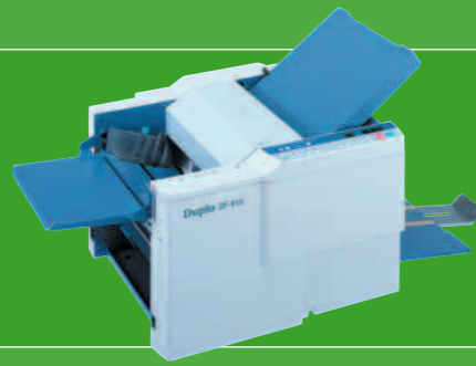
Automatic Folder DF-915